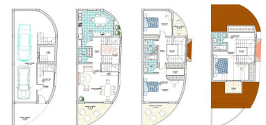
PLANTA BORDO 100,00 m 2 (1070,00 ft 2 ) 100,00 m 2 (1070,00 ft 2 ) 100,00 m 2 (1070,00 ft 2 ) PLANTA AZUL 100,00 m 2 (1070,00 ft 2 ) 100,00 m 2 (1070,00 ft 2 ) 100,00 m 2 (1070,00 ft 2 ) PLANTA ALTA 100,00 m 2 (1070,00 ft 2 ) 100,00 m 2 (1070,00 ft 2 ) 100,00 m 2 (1070,00 ft 2 ) PLANTA BAJA CUBIERTA 100,00 m 2 (1070,00 ft 2 ) 100,00 m 2 (1070,00 ft 2 ) 100,00 m 2 (1070,00 ft 2 )