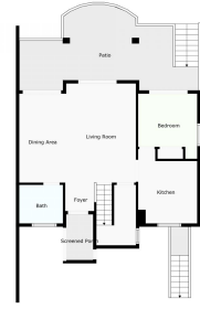
For Illustrative Purpose Only